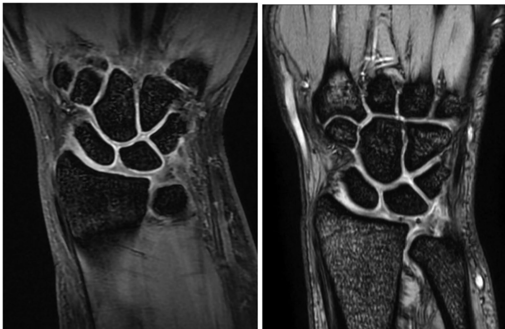
Fig. 2 A MRI view example of a patient before (left) and after (right) their all-inside arthroscopic suture anchor surgical procedure

repair the TFCC. Radiocarpal arthroscopy was done in 3, 4-, and 6U portals, and 1.9 arthroscope was used. When the hook test indicated positive, TFCC was repaired with two transosseous sutures. A line was drawn first near the ulnar neck along the axis of the ulnar styloid and olecranon. The retinaculum was incised and the ulnar cortex was exposed. An aiming guide was inserted into the 6R portal, and the target was aimed around the ulnar fovea region. Two tunnels of 0.045 inches in diameter were