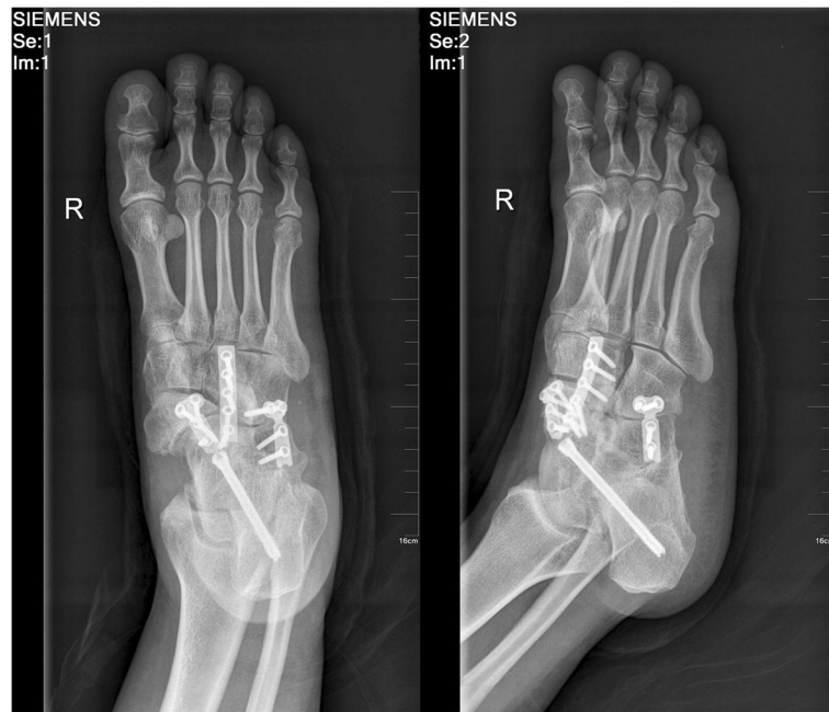
Fig. 3 Postoperative radiograph with open triple fusion