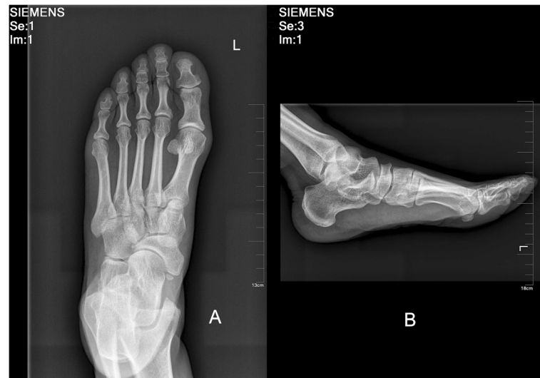
Fig. 2 a Anteroposterior and b lateral radiograph of the foot indicate a Mueller-Weiss disease preoperatively