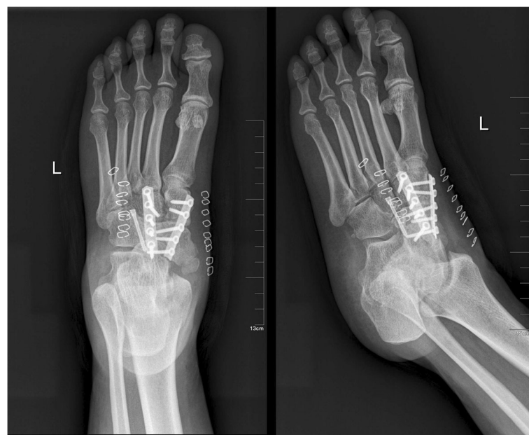
Fig. 4 Postoperative radiograph with talonavicular-cuneiform arthrodesis

There are 12 patients fulfilling the inclusion criteria of this study. One of them was unable to be reached and another refused to participate. Among the remaining 10