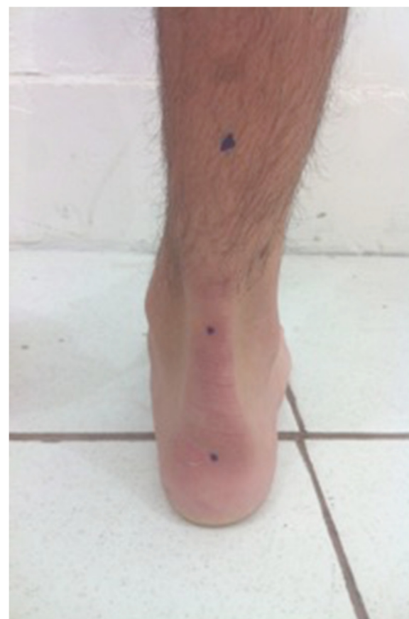
Fig. 1 Hind-foot alignment

Shoe abrasion was assessed manually with a metric plastic tape on the posterior part of the heel that comes in contact with the ground, comparing with a brand new standard army boot (Fig. 2). The posterior part of the