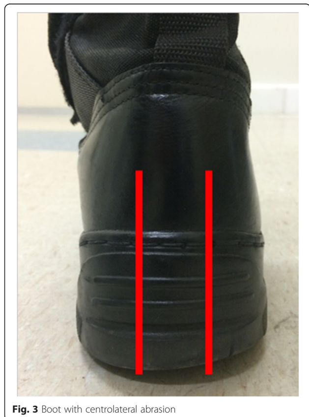
Fig. 3 Boot with centrolateral abrasion

The chi-square test was used in the correlation analysis of foot heel abrasion, foot alignment, sprains, and calf muscle shortening. A 95 % confidence interval was used to conclude that our results were statistically significant (alpha error = 0.05).