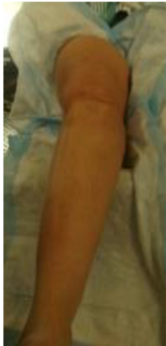
Fig. 1 Right knee with moderate valgus knee deformity (valgus degree is about 25°)

The aforementioned soft tissue balance should be performed in three stages. The first balance stage should be pie-crusting of iliotibial tract above joint line, elevating the iliotibial tract subperiosteally from Gerdy tubercle,