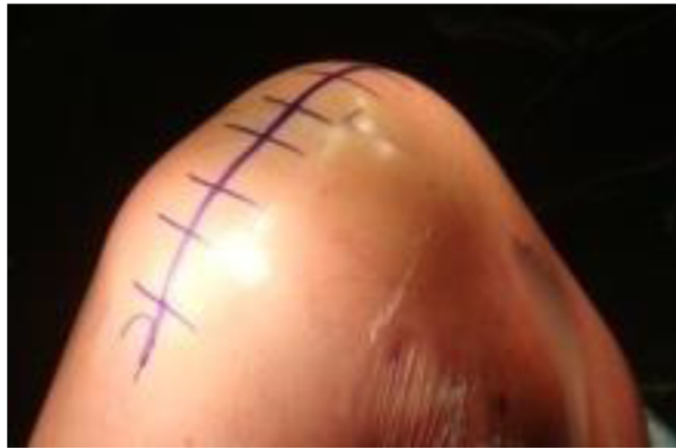
Fig. 2 The midline skin incision of right knee

femoral condyle [3]. After sequential release of these tissues, it is very important to keep checking the balance both in knee extension and flexion. A stage III release, including release of lateral head of gastrocnemius muscle and biceps tendon release, has been described by Buchel, but has never been performed during our valgus knee TKA surgery.