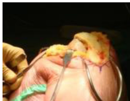
Fig. 3 The lateral parapatellar capsular approach