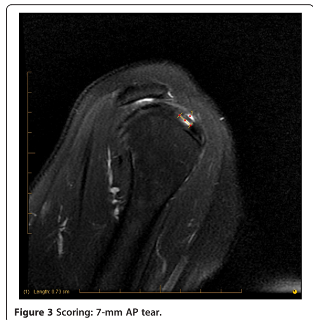
Figure 3 Scoring: 7-mm AP tear.

plane only and evaluated as less than 50% or greater than 50% of tendon thickness [3,13]. A comprehensive three-dimensional evaluation is considered important for monitoring of disease progression with and without treatment. For example, a less than 50% partial thickness tendon tear on coronal MRI is generally considered low grade. However, when associated with significant extension in the AP dimension and with severe tendonosis, this partial tear will score more highly on the proposed MRI cuff scoring protocol and would be more at risk of disease progression