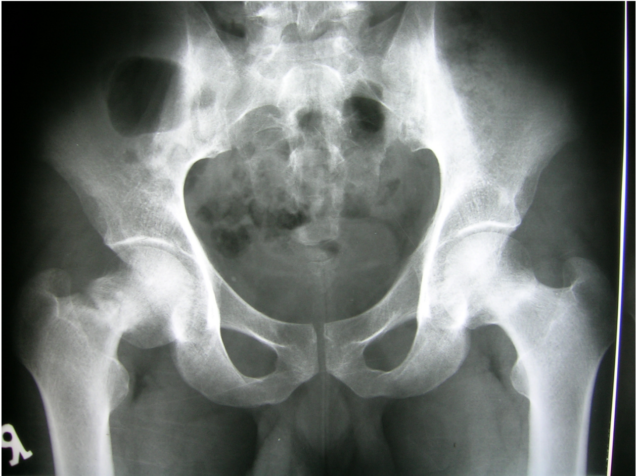
Figure 1 Radiograph taken 4 months before operation demonstrates displaced left femoral neck stress fracture and non-displaced right femoral neck stress fracture.

No limb-length discrepancy was observed because of symmetrical nature of the deformity.