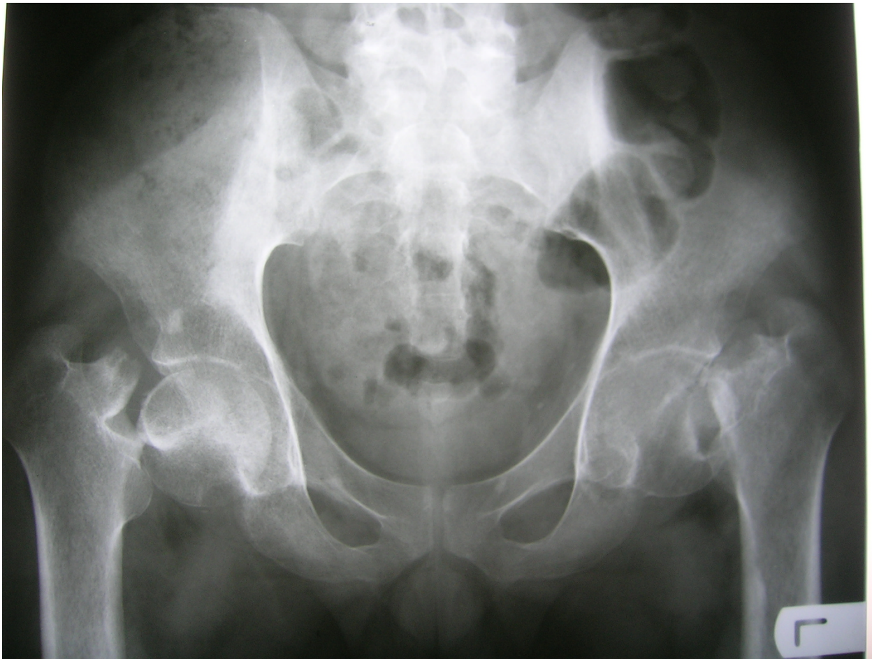
Figure 2 Radiograph taken before operation demonstrates displaced bilateral femoral neck stress fractures.