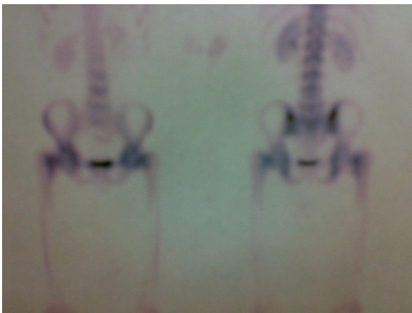
Figure 3 Skeletal bone scan with TC-99m showed no other abnormal findings except bilateral femoral head osteonecrosis and bilateral femoral neck fracture.