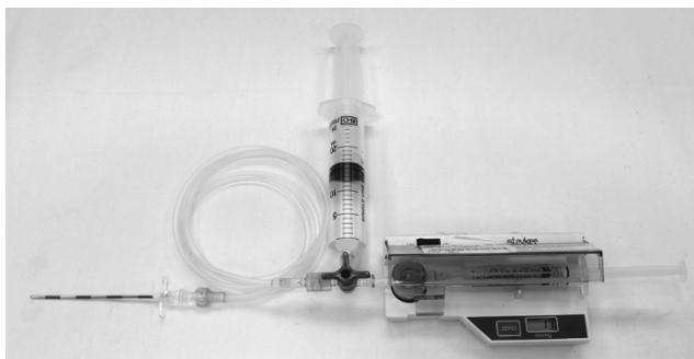
Figure 1 The digital pressure monitor system used to measure intra-capsular pressure of cadaveric hip. The whole system consists of a 18-gauge 3.25-inch epidural needle (Perican® with Tuohy bevel, B. Braun Melsungen AG, Brazil), an unyielded 54-inch connection tubing designed for arterial line measurement, a 3-way stopcock, a 25 ml syringe, and the Quick Pressure Monitor Set mounted inside the Stryker Pressure Monitor (Stryker Inc, Cedex, France). The Quick Pressure Monitor Set consists of a membrane drum, and a 3 ml syringe. It is manufactured by the same company as the consumable for the pressure monitor. The system was primed with saline.

years (mean = 84.2, standard deviation = 6.7). Twenty-two cadavers (69.8%) were female. Their body height varied from 124 to 168 cm (mean = 144.8, standard deviation = 7.3) whereas body weight varied from 41 to 62 kg (mean = 54.8, standard deviation = 4.5). The body mass index ranged from 16.1 to 25.2 kgm -2 (mean = 21.1, standard deviation = 2.0).