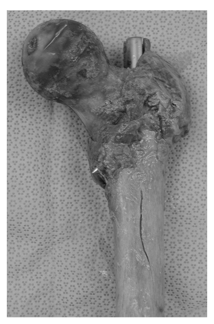
Figure 2 It is evident the longitudinal splitting in the anterior cortex of a femur.

No other fractures were found during inspection or radiographic control either in the first or in the second group. The radiographic and fluoroscopic control in the five frac-