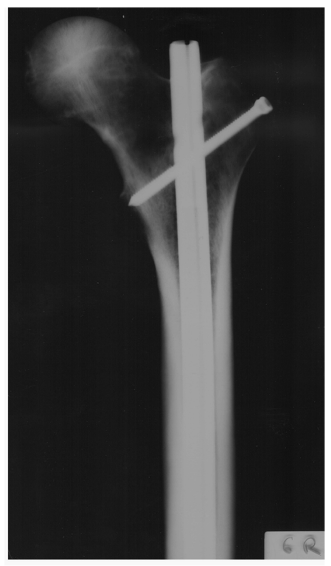
Figure 4 Anteroposterior radiograph of the same femur. No evidence of fracture line can be documented.

The placement of the nail more anteriorly to the posterior third of the neck in this study was complicated with a prevalence of 56% of anterior femoral splitting. All of these lesions were seen during nail insertion, at its final phase. A possible explanation could be that during reaming the flexible shaft of the reamers could easily follow the curved path of the medullary canal, as the femur is convex anteriorly. On the other hand, during nail insertion the relevant stiffness of the nail, the mismatch in curvature between the inserted nail and the medullary canal, in combination with an entry point anterior to the trochanteric fossa has possibly led to the femoral splitting. As described in an article by Egol et al [9], the average femoral anterior radius of curvature is 120 \text{ cm} (\text{SD} \pm 36) and there is a significant mismatch between the anatomical radius of curvature of the femur and most intramedullary