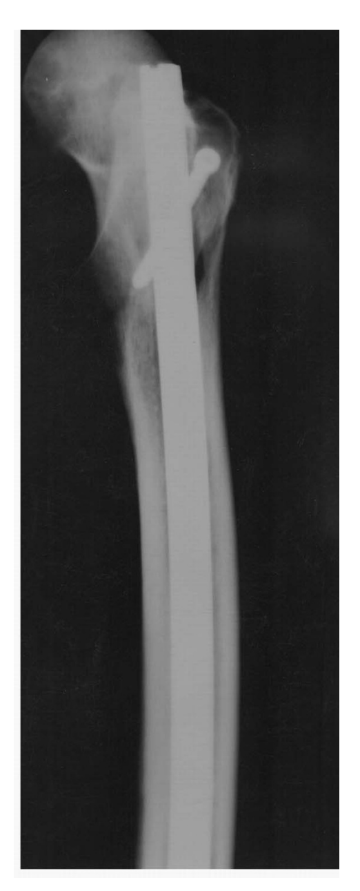
Figure 5 Lateral radiograph of the same femur . No evidence of fracture line can be documented.

Journal of Orthopaedic Surgery and Research 2008, 3 :30