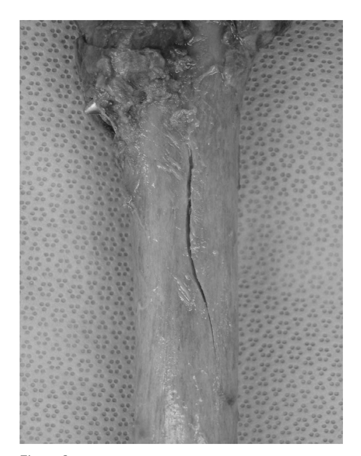
Figure 3 Close-up photo of the splitting in the same femur.

in consistent cracking of the proximal femur. Alho et al [8] also reported a 26% prevalence of proximal fragment comminution with an anterior insertion of the intramedullary nail. However, none of these studies used radiographic control to investigate the diagnosis of such lesions.