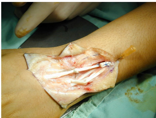
Figure 1 The extensor digitorum (ED) was reconstructed using free tendon grafting by means of a Pulvertaft technique.

The average of follow-up was 54.1 months (range, 40 to 72 months). The latest evaluation was based on both subjective and objective criteria, including the range of MCP joint flexion after surgery, the extension lag at the metacar-