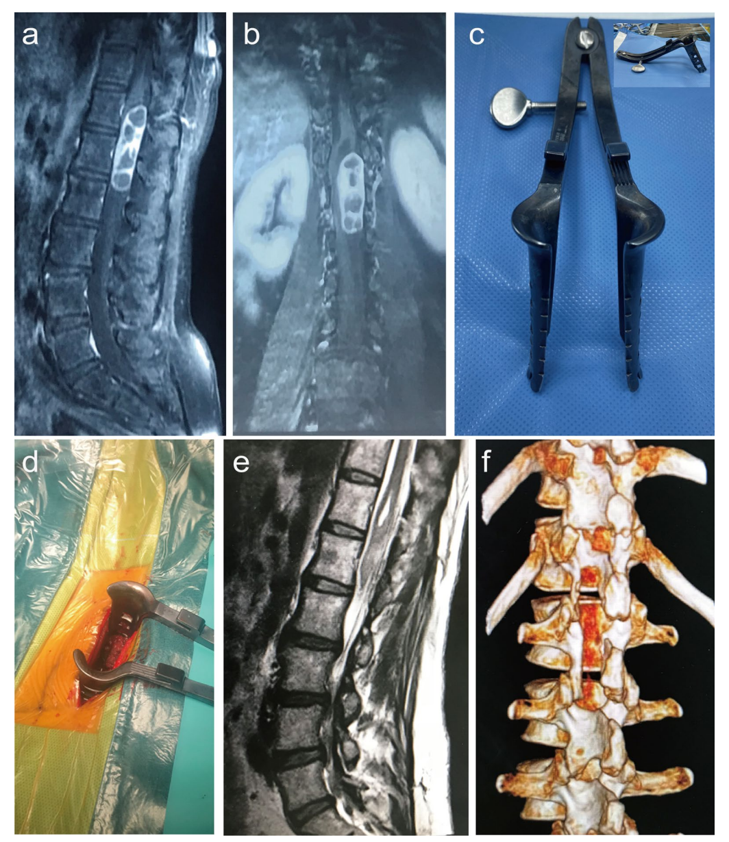
Fig. 2 Typical case: a A 51-year-old woman presented with low back pain and numbness in her left lower limb for 1 year. Postoperative pathological diagnosis was intraspinal schwannoma. Physical examination showed hypoaesthesia in lateral side of the left leg and dorsum of feet. a , b MRI indicated a space-occupying lesion from T12 to L2 transpinal canal. c Real-object picture of the special retractor. d Posterior paramedian approach combined with inverted V-shaped surgical access. e , f Postoperative X-ray and three-dimensional reconstruction CT suggested that the tumor tissue was completely resected and intervertebral joint was damaged in a small range

total laminectomy via posterior paramedian approach is highly traumatic and requires the vertical incision of bilateral paraspinal muscles and spinous processes, which are often the starting or ending points of the muscles adjacent to the spine. Even with careful and effective suturing and good healing, this is still a form of invisible and permanent damage to the muscles. The interspinous ligament plays an important role in stabilizing the