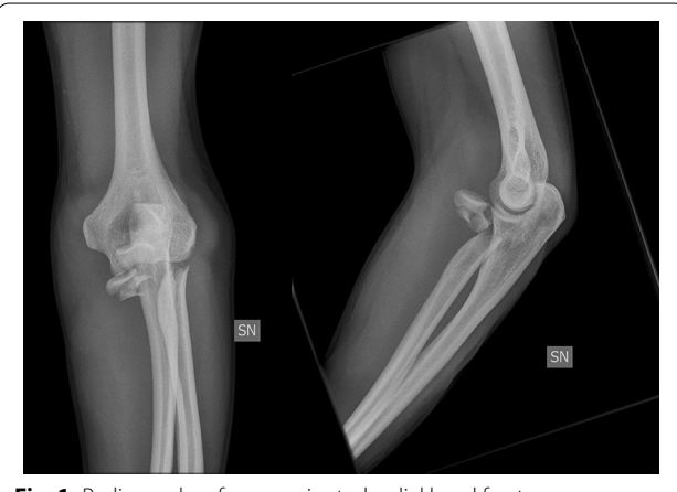
Fig. 1 Radiographs of a comminuted radial head fracture

The radial head implants had to be removed in 5 cases due to a radio-ulnar impingement with limited forearm rotation and soft tissue irritation after fracture healing.