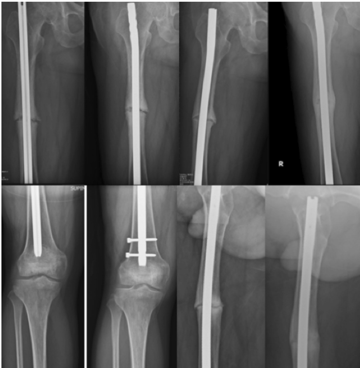
Fig. 3 A 42-year-old man sustained a right aseptic femoral shaft nonunion for 2 years. The prior Kuntscher nail was removed. Exchange nailing of dynamic assembly with modified bone grafting caused solid union at 3.5 months

multiple, accurate determination of unfavorable factors may be difficult [5]. Under such situations, surgical techniques which may concomitantly cover both favorable mechanisms while they will not greatly produce technical complexity are valuable practically. In the current study, a modified bone grafting technique was developed. The outcomes are considered quite successful.