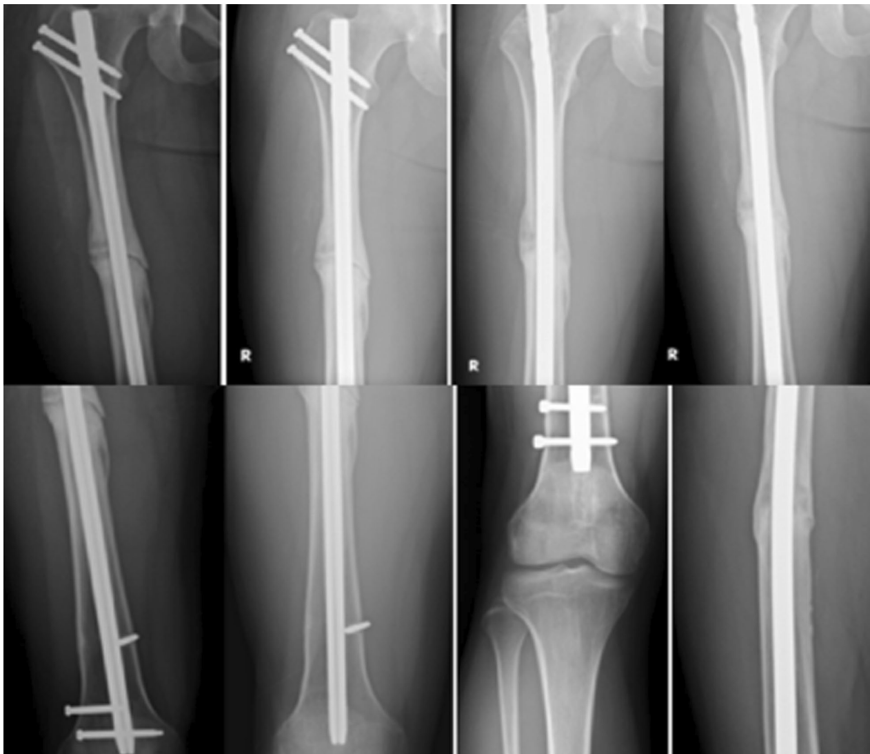
Fig. 2 A 32-year-old man sustained a right aseptic femoral shaft nonunion for 2 years. Although distal dynamization for the static locked nail was performed, the nonunion persisted for 2 years. Exchange nailing of dynamic assembly with modified bone grafting caused solid union at 4 months

radiographs. The treatment of choice is providing sufficient local stability. An atrophic nonunion is generally caused by loss of osteogenic power, which is due to segmental bone defects, comminuted fractures or destructive local vascularity. A rational treatment must greatly initiate osteogenic potential. Clinically, exchange femur nailing is believed to be able to provide favorable factors to reinforce both mechanisms [27]. However, radiographic identification is sometimes difficult. Exchange nailing may achieve insufficient amount of cancellous bone graft. It may be one of failed reason in exchange nailing. In the present study, all nonunions are added with cancellous bone graft to promote osteogenic potentials and healed totally.