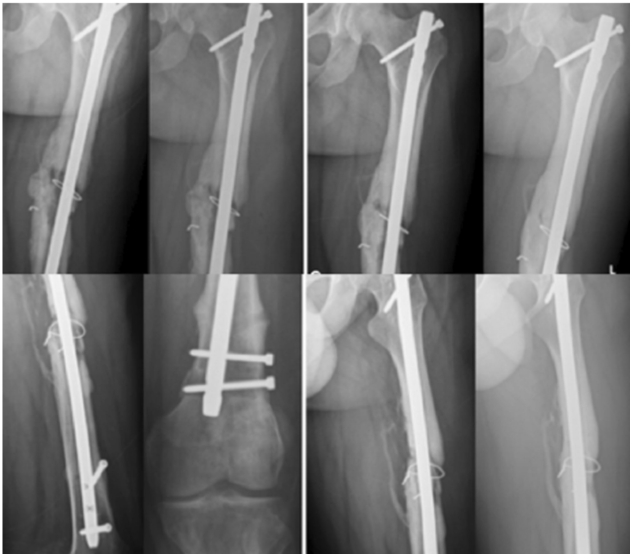
Fig. 4 A 52-year-old man sustained a left aseptic femoral shaft nonunion for 3 years. Exchange nailing of static assembly with modified bone grafting caused solid union at 4.5 months

and pushed by a smaller size reamer at the proximal bone segment around the nonunion site. The inserted locked nail which is 1-mm smaller than the finished reaming will have a space to keep the cancellous bone graft. If the nonunion site has a large bone defect, it can keep the cancellous bone graft more efficiently (Fig. 4).