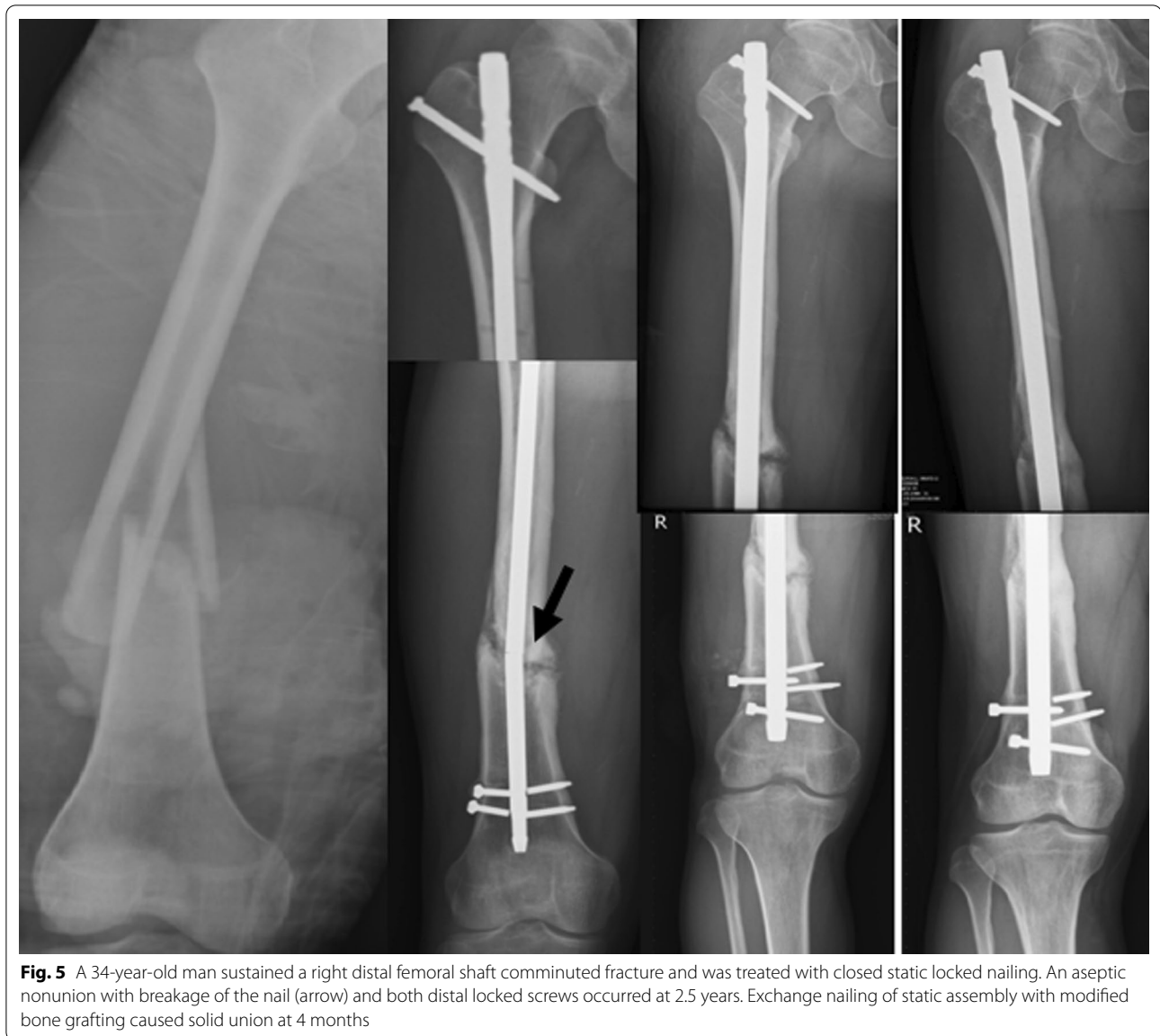
Fig. 5 A 34-year-old man sustained a right distal femoral shaft comminuted fracture and was treated with closed static locked nailing. An aseptic nonunion with breakage of the nail (arrow) and both distal locked screws occurred at 2.5 years. Exchange nailing of static assembly with modified bone grafting caused solid union at 4 months

via the screws and nails. Implant failure may occur if protected weight bearing is neglected. In the current study, all fractures healed and there was no implant failure.