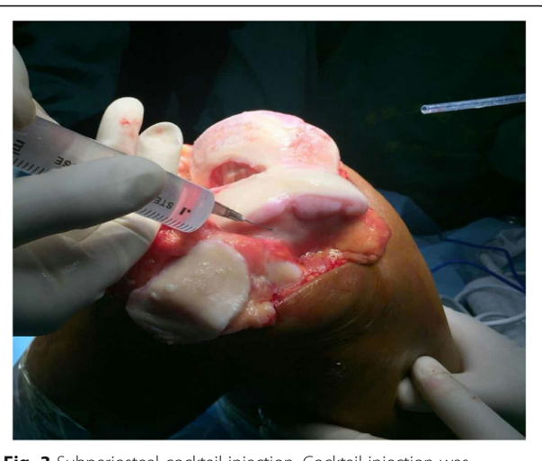
Fig. 3 Subperiosteal cocktail injection. Cocktail injection was performed under the periosteum of the distal femur and proximal tibia