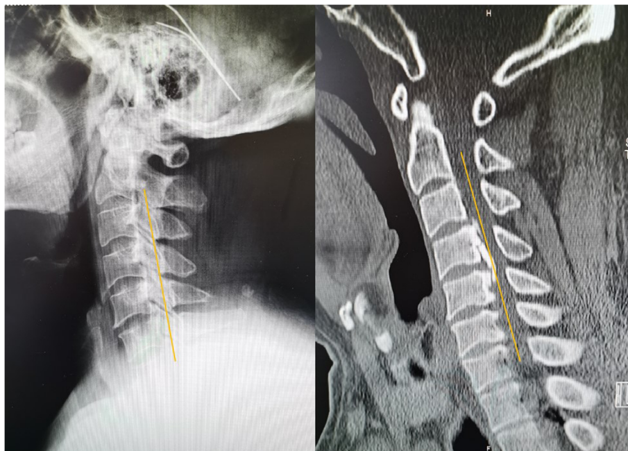
Fig. 1. Representative patient in the K-line (-) group. A 60-year-old man. The OPLL mass touched the K-line

The data of 108 patients (86 men, 22 women), aged 61.3 \pm 10.8 years, were retrospectively reviewed (Table 1). Overall, intraoperative blood loss was 236.8 \pm 105.2 mL, and postoperative drainage was 168.7 \pm 79.5 mL; hidden