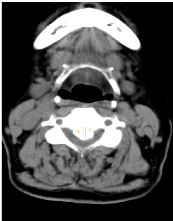
Fig. 3 The occupying ratio of the OPLL was calculated as: ossified thickness of the most stenotic area (b)/anteroposterior diameter of the spinal canal (a) \times 100%

blood loss was 276.6 \pm 108.1 mL. The surgical time was 101.8 \pm 26.9 min.