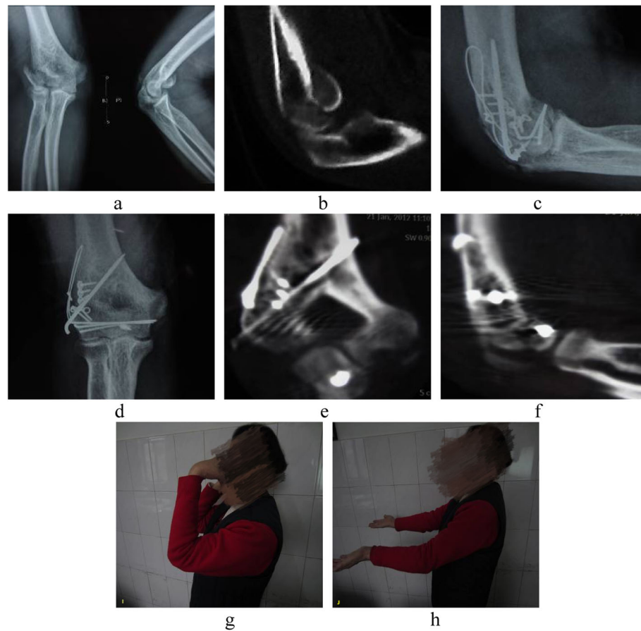
Fig. 2 Female, 62 years old, preoperative anteroposterior and lateral radiographs of capitellum and trochlea fractures caused by falling injury from stairs ( a ); preoperative CT showing the capitellum and trochlea fractures and intact posterior condyle ( b ); X-ray radiographs ( c, d ) and CT scans ( e, f ) 2 days after operation showing the reduction and fixation of the capitellum and trochlea, as well as the good restoration of articular surface of the distal end; functional appearance 1 month after operation showing satisfactory elbow function ( g, h )

Treatment options have evolved from fragment excision and closed reduction/immobilization to ORIF in order to achieve stable anatomic reduction, restore articular congruity, and initiate early motion [21–23]. However, various debates have ensued on which surgical fixation technique is most appropriate, which is crucial to the final outcome [24–26]. Presently, Kirschner wires, cancellous screws, Herbert screws, and Acutrak Mini screws are commonly utilized for rigid fixation using the fracture compression technique [27, 28]. Ashwood et al. contended that the maintenance of rigid fixation after fracture reduction, and the stability of the elbow joint are very important [29]. They further stated that the small fragments should be used for reduction and internal fixation. However, Sano et al. considered that if the screws were placed in the small fragments, it would be difficult for the screw threads to traverse the fracture line, resulting in failed fracture compression [30]. Therefore, this may lead to functional disabilities of the elbow joint, because patients cannot rehabilitate elbow joints at