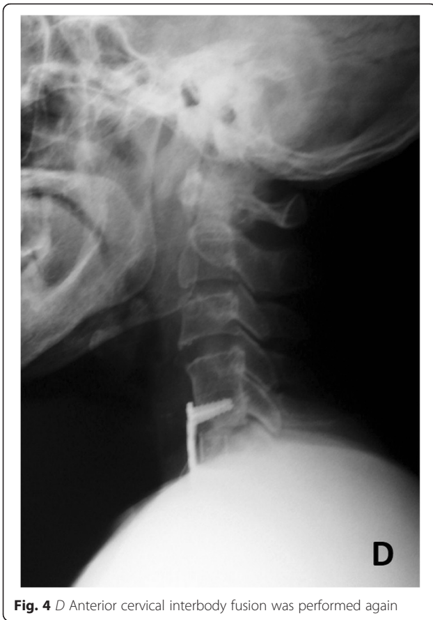
Fig. 4 D Anterior cervical interbody fusion was performed again

Saarinen et al. (72 %) [29]. In their report, 72 % of patients were satisfied with the result, which was better compared with our finding of 68.6 % of satisfied patients after the reoperation. In the current study, a total of 35 patients who underwent one-level ACDF for symptomatic new radicular or myelopathic symptoms from ASD results showed that the clinical symptoms were significantly improved after a 2-year follow-up. However, there was no difference between the groups at the final follow-