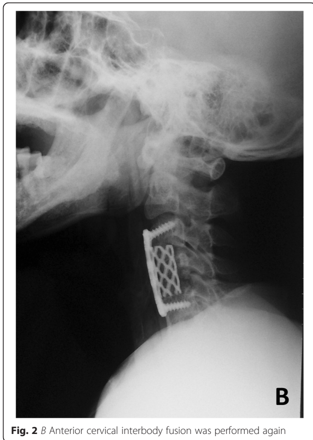
Fig. 2 B Anterior cervical interbody fusion was performed again

measurements of JOA, NDI, and VAS for neck and arm pain for each group. The independent two-sample t test was used to identify a significant difference between the groups. In all analyses, significance was defined as P < 0.05 . Results were presented as mean \pm standard deviation.