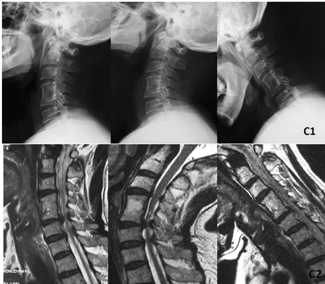
Fig. 3 A 58-year-old woman developed one-level adjacent segment disease 12 years after primary surgery. (C1) Radiograph and (C2) MRI (flexion/extension) at 12 years after operation indicate C5–6 disc hernias

suggested that these levels were more likely to develop ASD. It was well established that each intervertebral disc undertook different intradiscal pressures and ROM in the cervical spine [7, 15, 19]. Bydon et al. suggested that the specific spinal level might be a degenerative spinal disease development, but was not directly related to surgery. It suggested that the ASD was not directly due to the level of the index fusion itself [25]. The biomechanical study reported vertebral levels adjacent to C5/C6-simulated ACDF in cadaveric cervical spines which exerted increased intradiscal pressures and ROM at both superior and inferior adjacent levels during both flexion and extension [26]. During flexion and extension of the cervical spine, C4/5 level had higher intradiscal pressures and increased ROM compared to C6/C7 level.