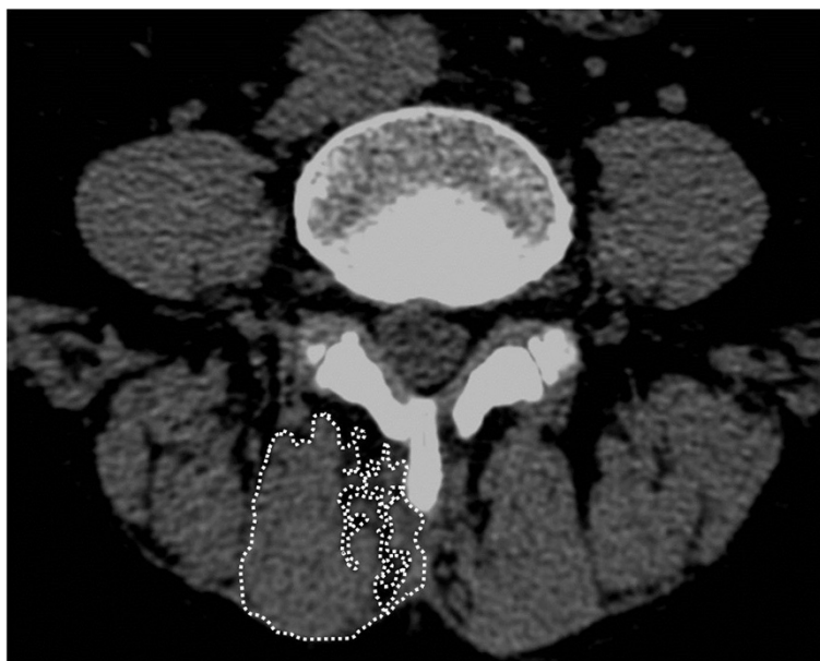
Figure 2 Measurement of the cross-sectional area of the multifidus muscle in an atrophied muscle. Cross-sectional area was the sum of all the area outlined in white.

the three groups in the reduction in CSA ( -2.99 \pm 1.58 in group A, -2.34 \pm 2.08 in group B, and -2.34 \pm 1.12 in group C) ( p = 0.270 ). There was also no significant difference in preoperative VAS of the back, VAS of the legs, and ODI ( p = 0.996 , p = 0.630 , p = 0.111 ), nor in postoperative VAS of the back, VAS of the legs, and ODI ( p = 0.169 , p = 0.161 , p = 0.157 ) (Table 3). The reduction of CSA showed a statistically significant positive correlation with the postoperative VAS of back ( p = 0.025 , r = 0.562 ); however, it did not show any statistical significance from VAS of the legs ( p = 0.437 , r = 0.082 ) or ODI ( p = 0.106 , r = 0.017 ).