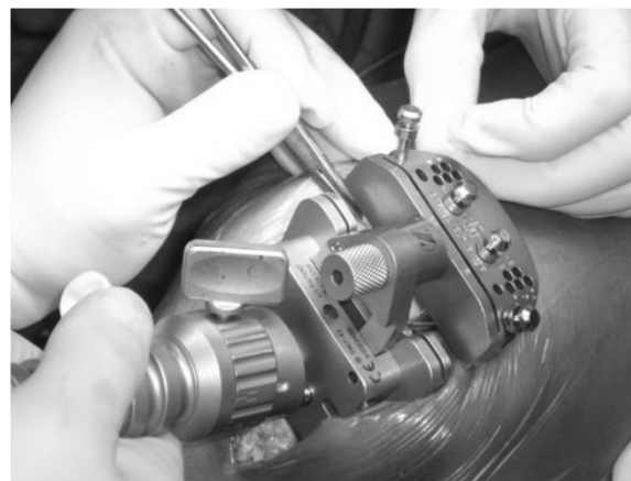
Figure 3 Minimally invasive total knee arthroplasty (MIS-TKA) using an intramedullary cutting guide to resect the distal femur.