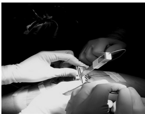
Figure 2 Use of electromagnetic CAS-MIS-TKA to guide the resection of the distal femur.

Both groups had the same postoperative pain control and rehabilitation consisting of a multimodal approach, which aims to avoid parenteral narcotics and early postoperative mobilization. Perioperative parameters (operative