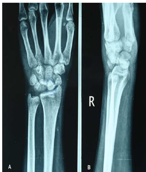
Figure 1 Preoperative radiograph showing a neglected transscaphoid perilunate dislocation; (A) Anteroposterior and (B) Lateral views.

study was obtained by the Institute Ethics Committee. Diagnosis of perilunate dislocation was established on standard anteroposterior, lateral and stress radiographs. Figure 1 shows preoperative anteroposterior and lateral radiographs of a neglected transscaphoid preilunate dislocation. Computed tomography scans with 3D reconstructions and fine 1 mm cuts were done in all the patients to look at the size of the fragments and anatomy of the carpal bones. Magnetic resonance imaging was also obtained to look for vascular status of the scaphoid.