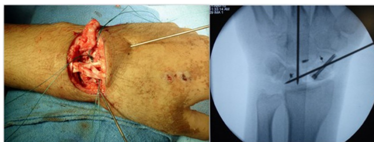
Figure 3 Intraoperative image showing placement of K wires to hold the fracture- dislocation and placement of suture anchors. Placement of headless screw and suture anchors can be seen on intraoperative radiograph.

of the shoulder, elbow and digital articulations were started in the immediate postoperative period. Active assisted and passive mobilisation of the wrist was started at 2 weeks. Intrinsic muscle strengthening and grip exercises were begun at 2 months. Return to full activities or sports was allowed at 4–6 months.