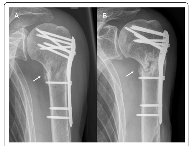
Figure 3 Example of a failed plate fixation without calcar screws at 6 weeks (A) and 9 months (B) after surgery. Notice non union at the medial cortex (white arrow).

named above was required in 6 (C+, 15.4%) and 4 (C-, 19.0%) patients (Table 2). No neurological deficits were observed in group C-, while in group C+ one patient had persistent dysaesthesia in his palm, most likely because of intraoperative stretch of the brachial plexus. Another patient in group C+ complained about paresthesia in all fingers of the operated arm although an electroneuromyography revealed no traceable nerval lesion and his underlying schizophrenic disease might have influenced the patient's perception. There was no clinical indication of a lesion to the axillary nerve in any of the 60 patients (Table 3). The measurement of the head-plate distance was only possible in 44 patients (C-: n = 16, C+: n = 28) due to incorrect projection of the radiographs in 16 patients. Measurements of head-plate distance (Figure 4) yielded a significant loss of reduction in group C- (2.56 \pm 2.65 mm) compared to C+ (0.77 \pm 1.44 mm; p = 0.01). Post-hoc analysis revealed a power of 0.97 for measurements of a loss of reduction (n = 44).