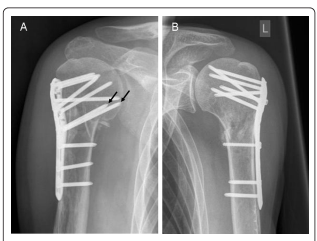
Figure 1 Angular stable plate fixation with (A) and without (B) calcar screws. Arrows pointing at calcar screws.

All patients with a proximal humeral fracture who underwent angular stable plate fixation (PHILOS, Synthes, Oberdorf, Switzerland) in our hospital between 01/2007 and 07/2009 were included in the present study. All data was collected according to the terms of reference specified by the local ethics committee.