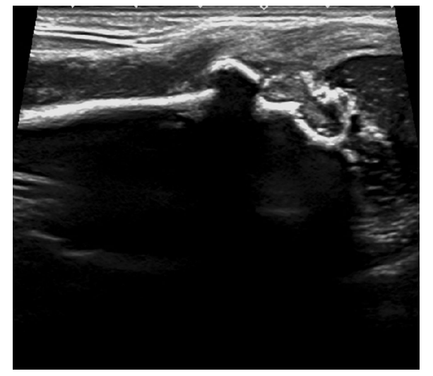
Fig. 3 Bone marrow pus cavity of lower femur