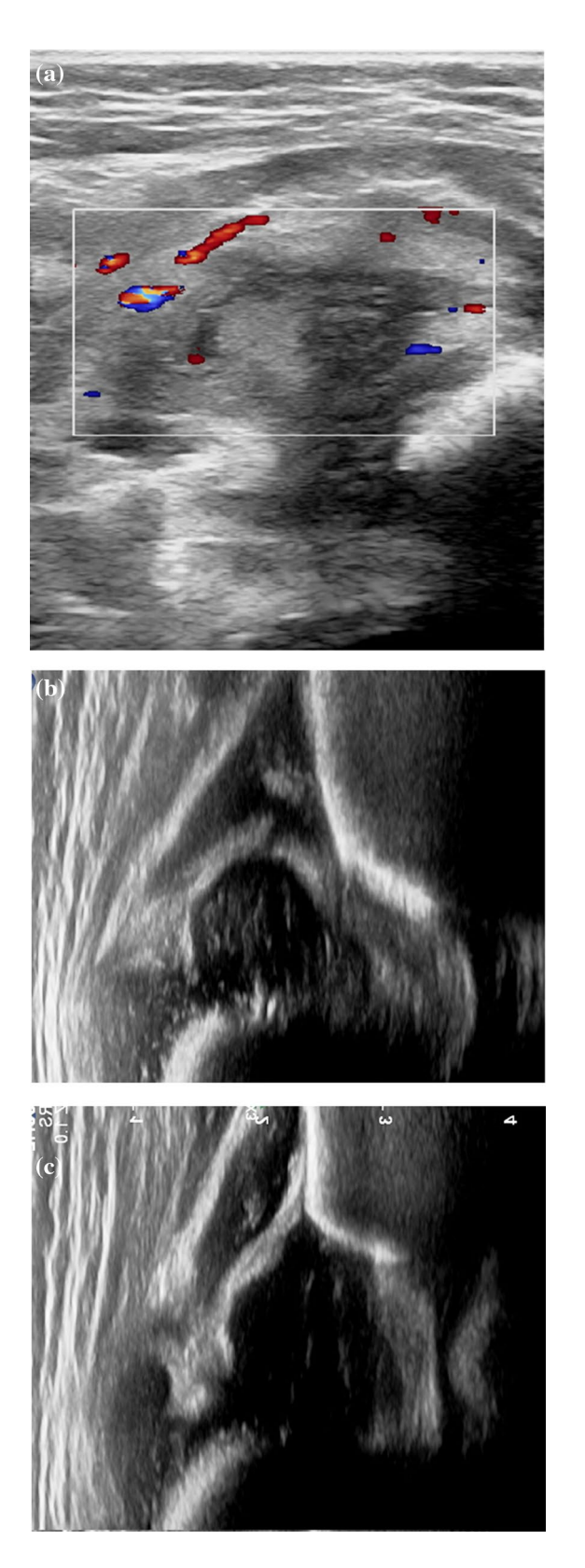
Fig. 5 Suppurative coxitis with hip dislocation. A Thickening of the hip capsule, fluid accumulation in the joint cavity with poor sound transmission, and prolapse of the femoral head outside the acetabulum (B). C: The contralateral joint is normal

Huang et al. Journal of Orthopaedic Surgery and Research (2024) 19:220