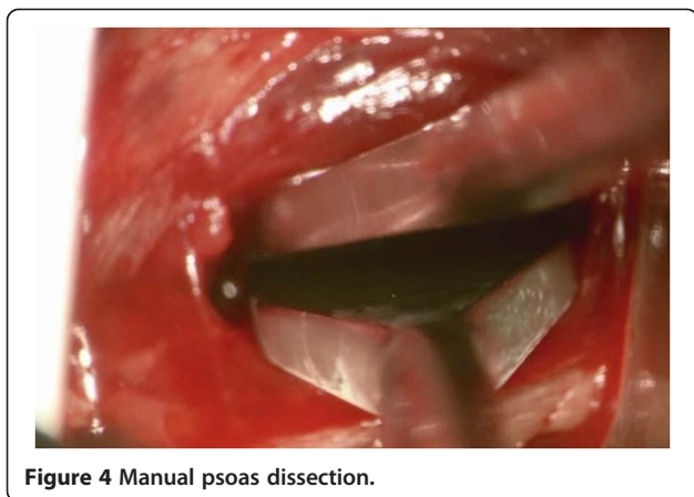
Figure 4 Manual psoas dissection.