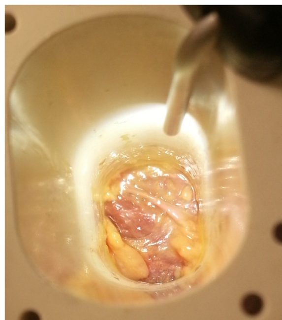
Figure 3 Direct psoas and nerve visualization.

roots are most commonly observed to the posterior. Two hand-held blades and an inner sleeve are used to retract the psoas muscle to the level of the disc an annulotomy is performed (Figure 5). Dissectomy and endplate preparation are then completed using standard instruments. Autogenous bone graft material is packed inside a PEEK implant, which is inserted into the disc space. Final anteroposterior and lateral images are taken, all instrumentation is removed, and the wound is closed in the standard fashion. The technique is indicated for use with supplemental fixation devices, which may be selected at the surgeon's discretion.