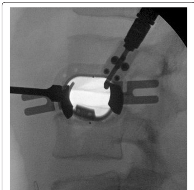
Figure 5 Lateral fluoroscopic image of fully-assembled DV-LIF retractor.

All complications, regardless of severity, were recorded into a pre-defined database (Table 2). Complications were categorized as mild, moderate, or severe. A mild complication was transient or caused mild discomfort, required no intervention/therapy, and did not interfere with the normal activities. A moderate complication caused some limitation in activity, which may have required assistance, and no or