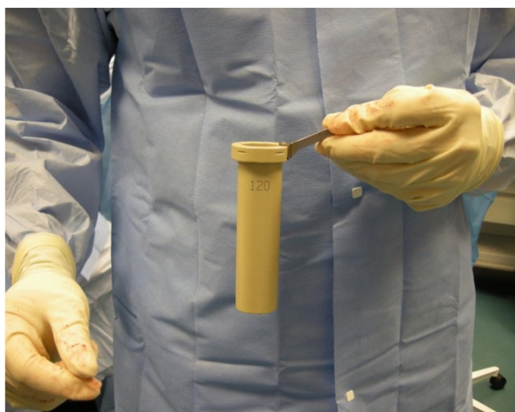
Figure 1 Fixed radiolucent tube allows for direct psoas visualization and improves fluoroscopic visibility.

With the patient in the lateral decubitus position, true anteroposterior and lateral fluoroscopic images are obtained. A 3-cm anteroposterior incision is made over the center of the disc space, and dissection is continued deep to the external oblique fascia. The muscle layers of the abdominal wall are longitudinally separated with blunt instruments to access the retroperitoneal space. The surgical corridor is then established using sequential blunt dilators inserted through the retroperitoneal space and onto the surface of the psoas muscle. Once correct retractor position is confirmed with fluoroscopy, a radiolucent tube (Figure 1) is inserted, the dilators are removed, and a lateral fluoroscopic image confirms correct positioning over the disc space (Figure 2). At this point in the procedure, the psoas muscle and surrounding nerves can be directly visualized (Figure 3). Dissection continues in the anteroposterior direction to the level of the disc (Figure 4). The nerve roots may be directly visible through the tube prior to and during dissection. Depending of the level treated, the sensory root may be observed traversing the surface of the muscle, while the motor