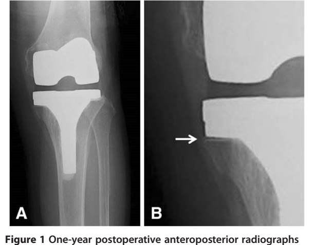
Figure 1 One-year postoperative anteroposterior radiographs revealing the radiolucent line beneath the metal augmentation (arrow) in an 85-year-old woman. (A) Overall view of radiograph. (B) Magnification of the medial tibia.

Thirty-three knees of 27 patients met our inclusion criterion. One knee was excluded because the follow-up period was under 3 years. As control group, 132 varus