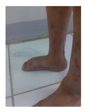
Figure 6 Final clinical presentation of the patient 38 months after surgery showing an excellent clinical outcome, with a comparable valgus hind foot angle of the right foot.