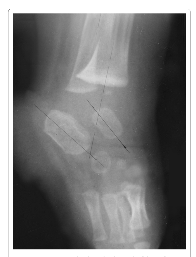
Figure 4 Preoperative plain lateral radiograph of the Rt. foot, with passive dorsiflexion of the foot, showing parallelism of the talus and calcaneus, severe equinus of the calcaneus and an acute tibio-calcaneal angle.

1. Seven feet developed wound dehiscence after removal of sutures two weeks after surgery, (they were operated