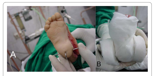
Figure 3 Intraoperative photos showing A; complete deformity correction with a straight lateral border of the foot, and the 3 pins inserted into position to provide better control during casting, and B; the circular "orthopad" pieces in position to cover the ends of the second coronal pin medially and laterally.

The clinical hind-foot axis measurement at the final follow-up visit revealed values from 0° to 11° valgus with a mean of 5°.(Table 4).