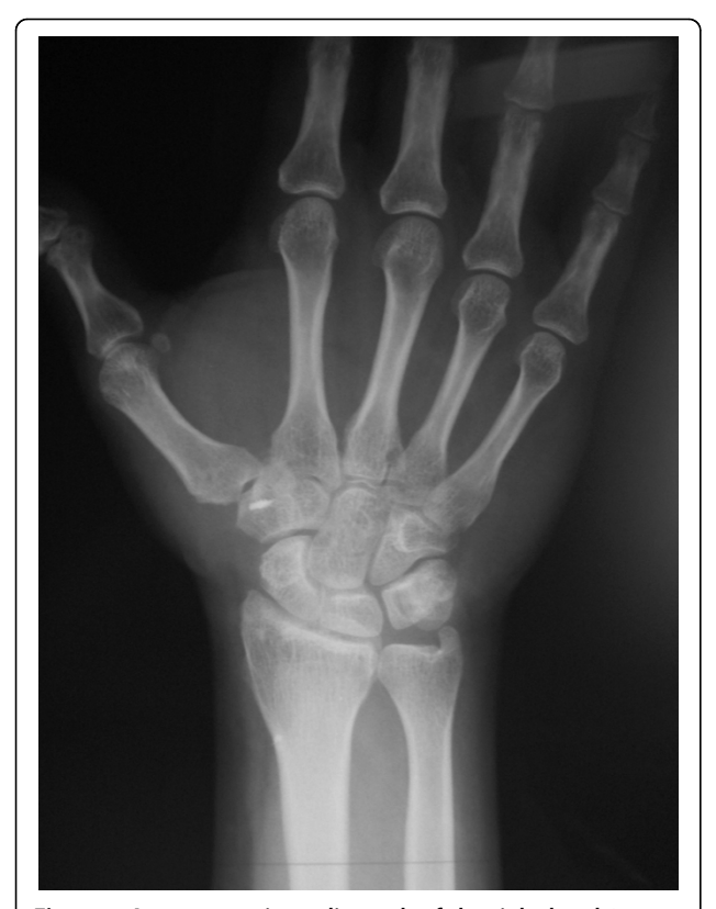
Figure 4 Anteroposterior radiograph of the right hand 3 years post-operatively. Good joint congruency without signs of instability or osteoarthritis are seen.

However, Strauch et al [6] in a cadaveric found that the dorsoradial ligament complex was the primary restraint to dorsal dislocation and responsible for