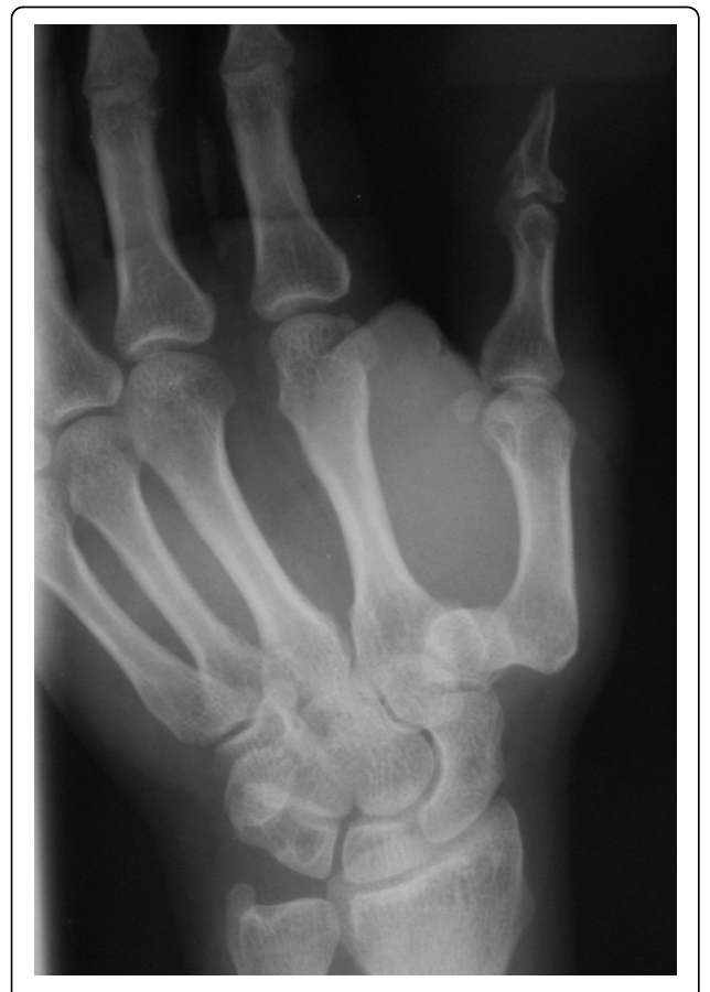
Figure 1 Anteroposterior radiograph of the right hand. Isolated thumb CMC joint dislocation is evident.

Intra-articular injection of local anaesthetic (xylocaine 2%) was followed by closed reduction of the carpometacarpal joint dislocation. However, the joint found to be grossly unstable and reconstruction of the dorsal capsuloligamentous complex occurred. The procedure was performed within few hours of the injury under regional anaesthesia using a dorsoradial approach. The dorsoradial ligament of CMC joint was found to be completely torn from its proximal insertion leaving a small cuff attached on the trapezium. The joint capsule was also transversely torn in its mid-substance but no articular cartilage lesions in both joint sides were evident. (Figure 2). The volar ligament was remained also intact. After debridement of the dorsal surface of the trapezium the dorsoradial ligament was stabilized onto trapezium using a Mini-Mitec suture anchor loaded with a 2-0 suture material (Ethibond). Furthermore, the CMC joint capsule was repaired in an