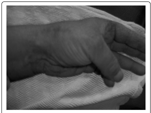
Figure 3 Appearance of the right hand 3 years postoperatively. The patient had normal and painless thumb movement.

At 3-year follow-up, the patient was pain free and returned to the pre-injury level of activity. No limitation of thumb carpometacarpal joint mobility or residual instability was observed (Figure 3). Radiographic examination revealed normal joint anatomy without any signs of subluxation or early osteoarthritis (Figure 4).